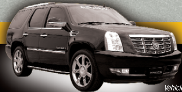
Vehicle equipped with Kit #9979 (patent pending)