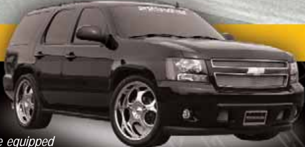
Vehicle equipped with Kit #9977