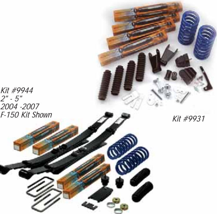
Kit #9944 2" - 5" 2004 -2007 F-150 Kit Shown