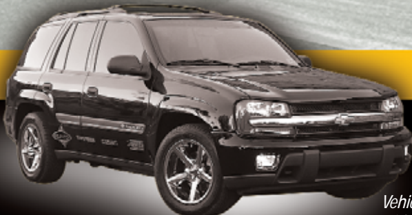
Vehicle equipped with Kit #9953