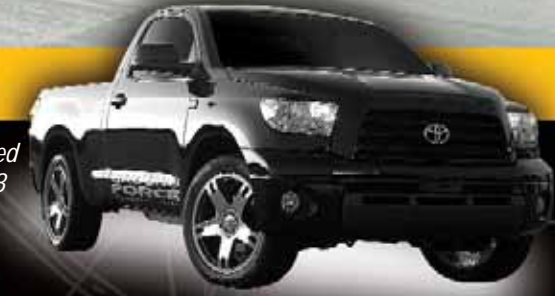
Vehicle equipped with Kit #9858