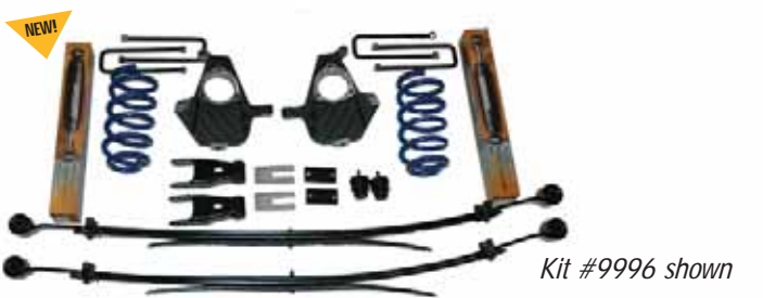
Kit #9996 shown