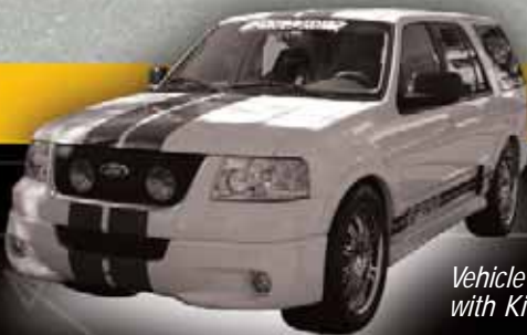
Vehicle equipped with Kit #9968