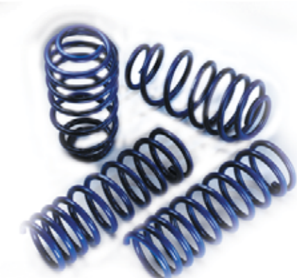
Kit #9926 shown