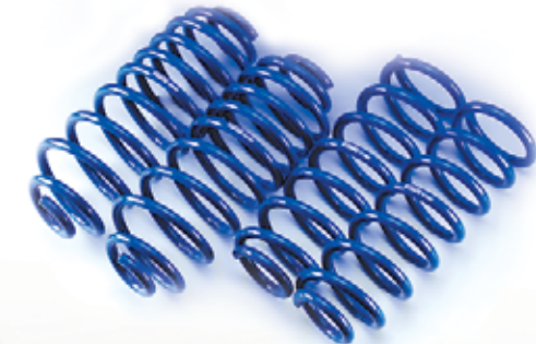
Kit #9953 shown

The new Ford Explorer screams to be lowered. Lower yours the right way with a Ground Force Lowering coil kit. With our new kit we compliment Explorer's new hot suspension with a lower stance to give your Explorer a tight sporty look! Go with Ground Force!