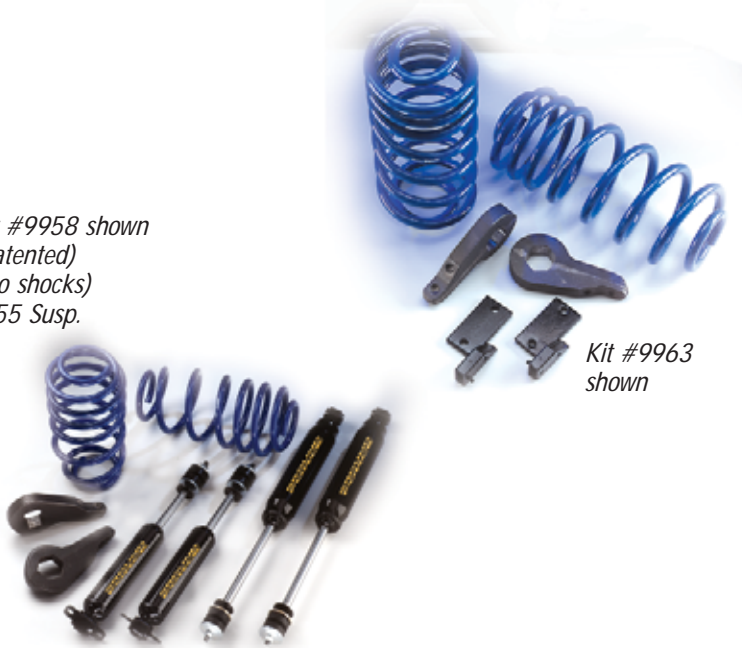
Kit #9963 shown

Conquer the street or trail with Ground Force's H2 Hummer Drop System for your H2 with Rear Coil or Air Ride Application. Retain full functionality of 4WD system with both kits.