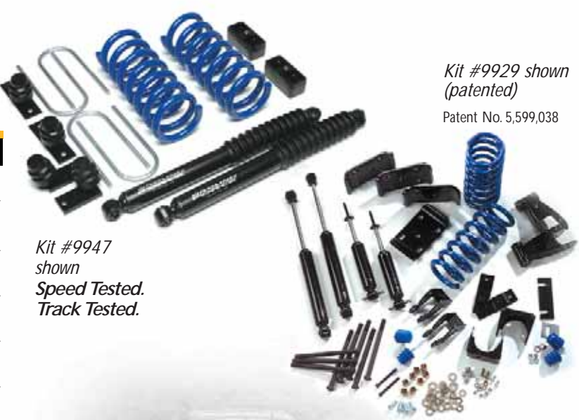
Kit #9947 shown Speed Tested. Track Tested.