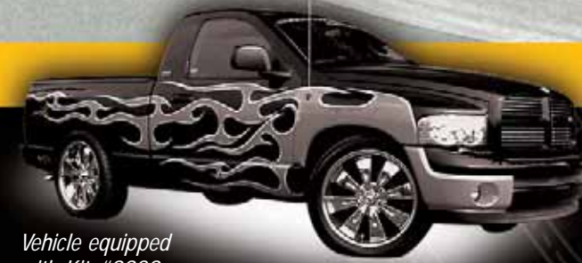
Vehicle equipped with Kit #9929