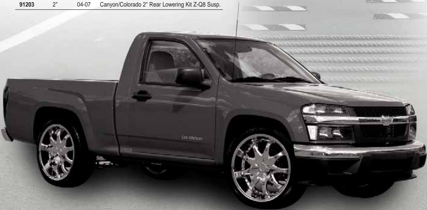
Ground Force Proving Ground