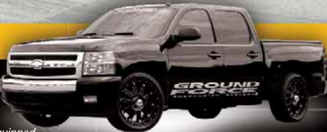
Vehicle equipped with Kit #9993