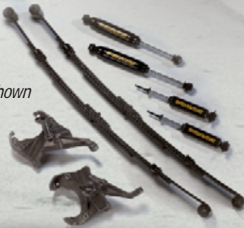
Kit #9664 shown