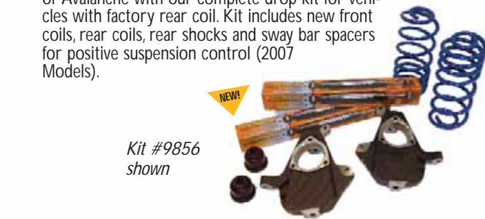
Kit #9856 shown

Introducing Ground Force's new slammin' kit for the original flag-ship! Our kit will lower your Yukon, Suburban, Tahoe or Avalanche with our complete drop kit for vehicles with factory rear coil. Kit includes new front coils, rear coils, rear shocks and sway bar spacers for positive suspension control (2007 Models).