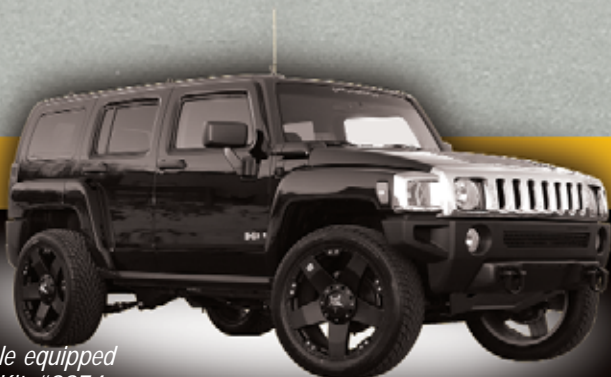
Vehicle equipped with Kit #9974