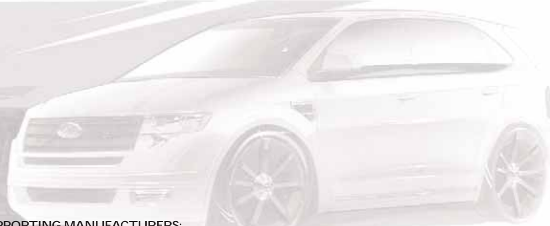
Concept Drawing for Ford Motor Co. by Ground Force.

Ford Motor Co. • General Motors • Daimler Chrysler • KMC Wheel Co. • Toyo Tires • General Tire • Corsa Exhaust • Green Filter USA • Street Scene