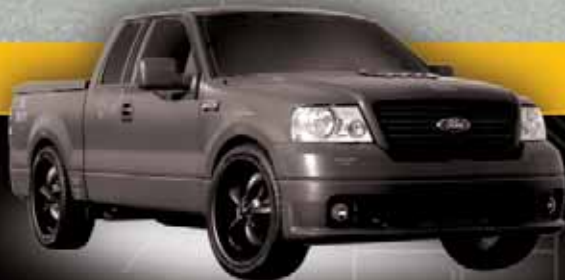
Vehicle equipped with Kit #9998