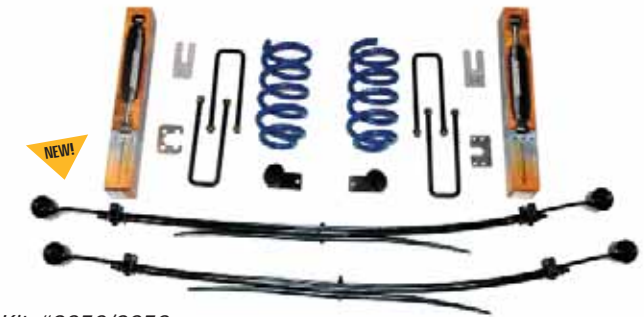
Kit #9852/9858 shown